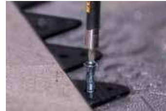
5/8" (15mm) height